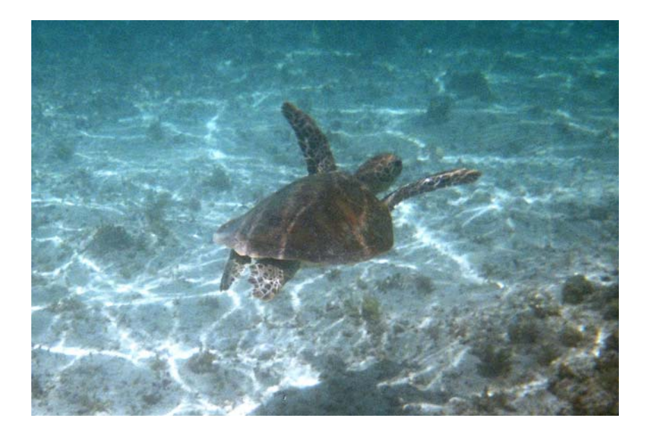
One of the numerous turtles with which we swam.