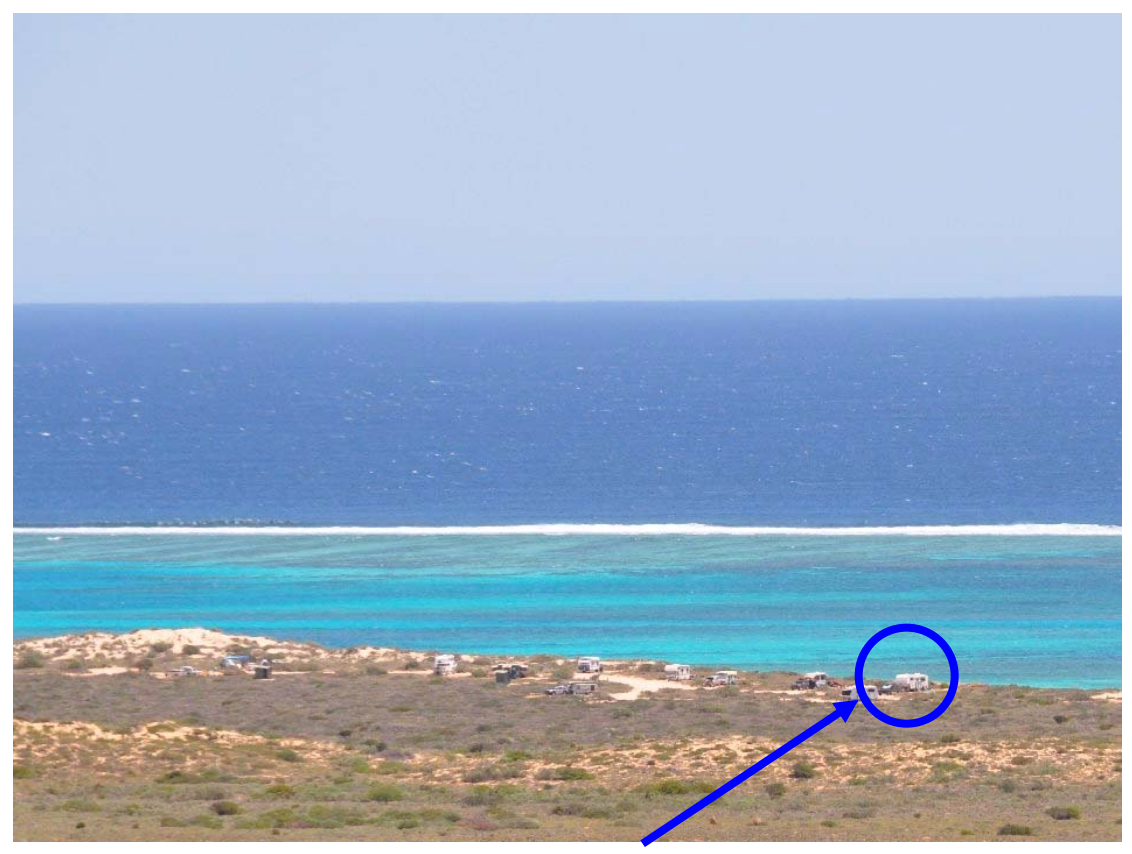
That's our home. The shallows of the reef can be seen out to the breakers

Some of the underwater shots while we were snorkelling. Unfortunately, being a disposable camera and murky conditions, they are not as good as we would have hoped. Note to oneself, buy a decent underwater camera.