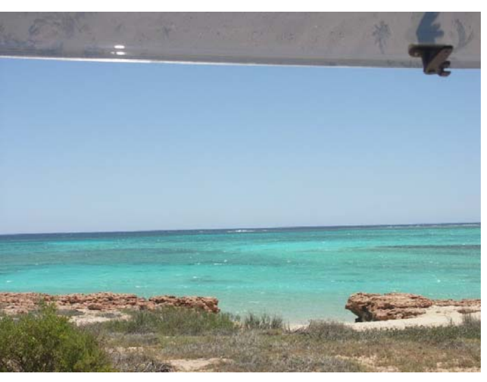
View from our back window