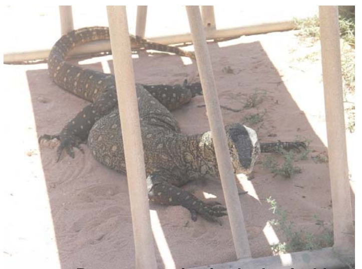
Bungarra resting in shade of table