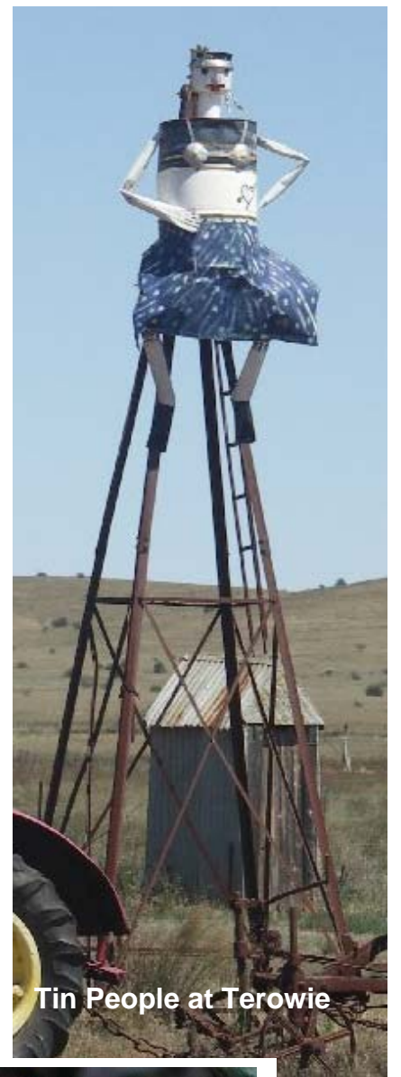
Tin People at Terowie