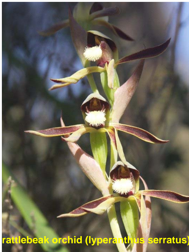
rattlebeak orchid ( lyperanthus serratus )