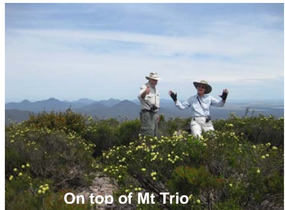
On top of Mt Trio

showed us some unusual orchids which we would never have found ourselves, including Hammer, Flying Duck, Rattlebeaks and Zebra orchids. There were also various Sun orchids flowering when we left.