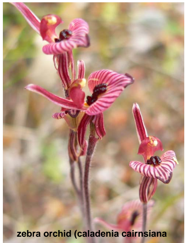
zebra orchid ( caladenia cairnsiana )