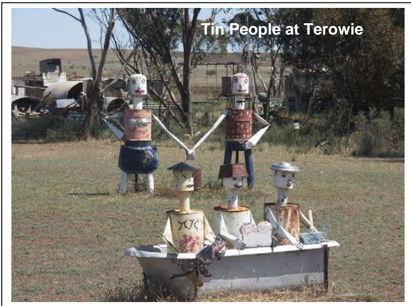
Tin People at Terowie