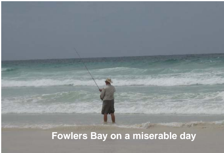
Fowlers Bay on a miserable day