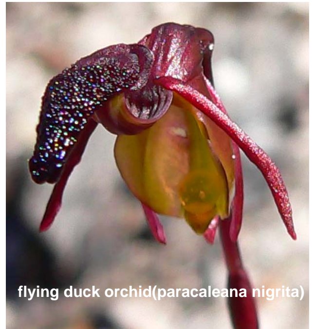
flying duck orchid( paracaleana nigrita )