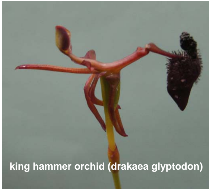
king hammer orchid ( drakaea glyptodon )