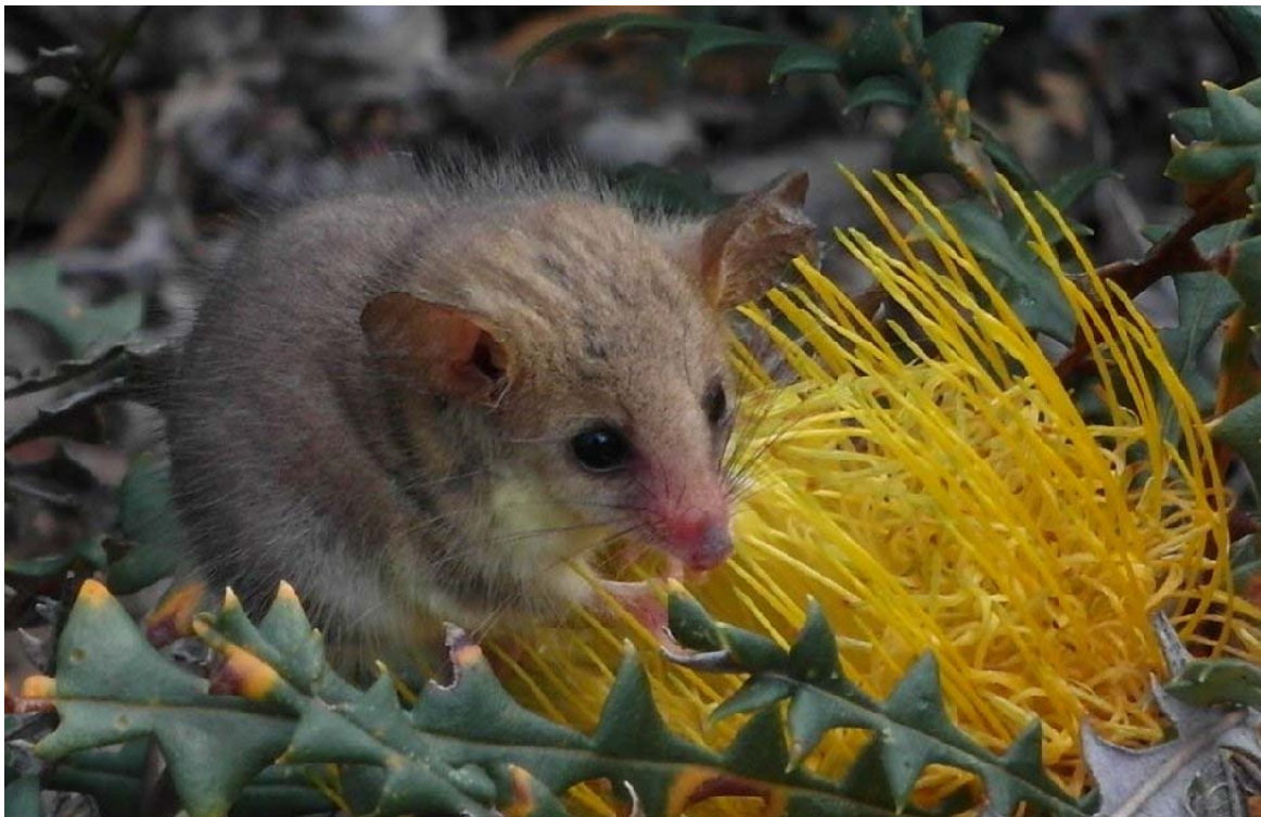
Pygmy possum at Dryandra Woodlands