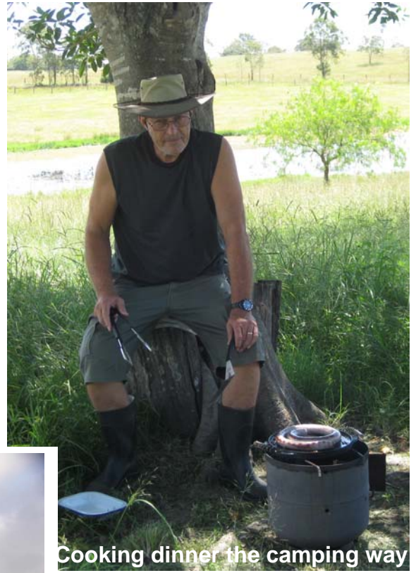
Cooking dinner the camping way at Neurum