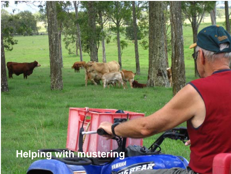
Helping with mustering