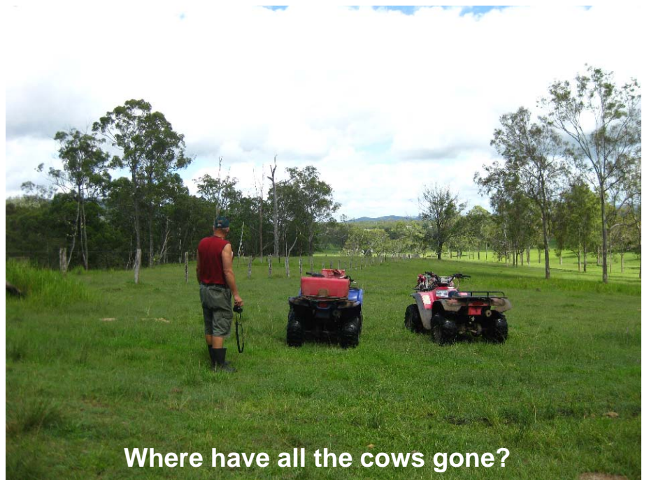
Where have all the cows gone?