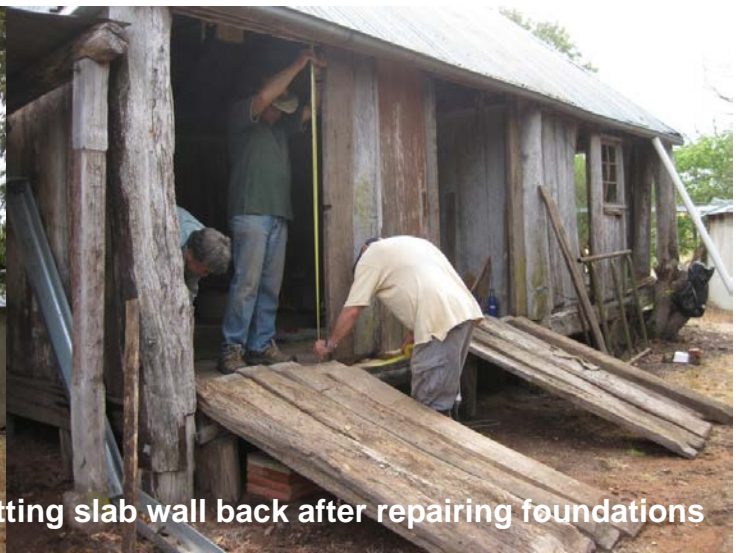
Putting slab wall back after repairing foundations