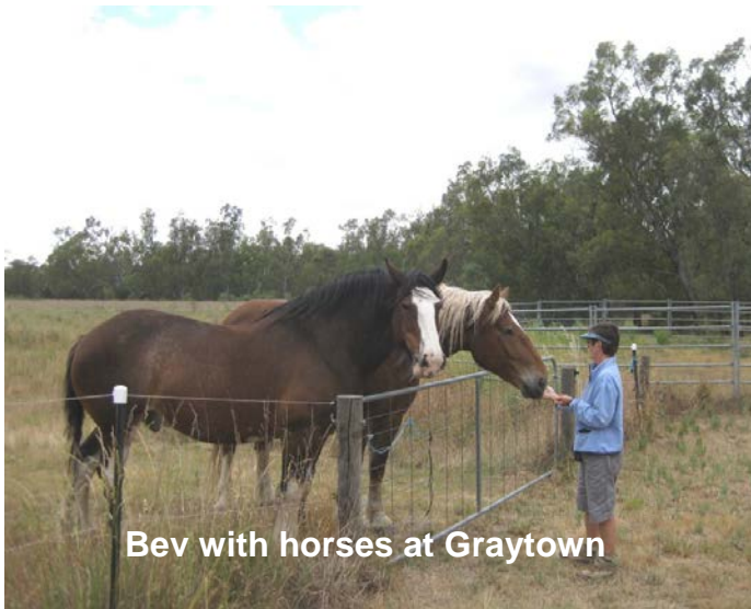
Bev with horses at Graytown