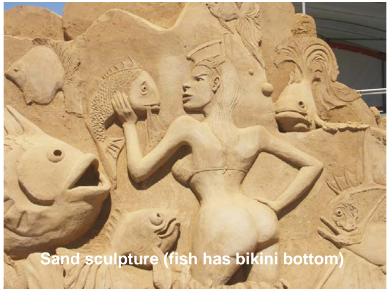
Sand sculpture (fish has bikini bottom)