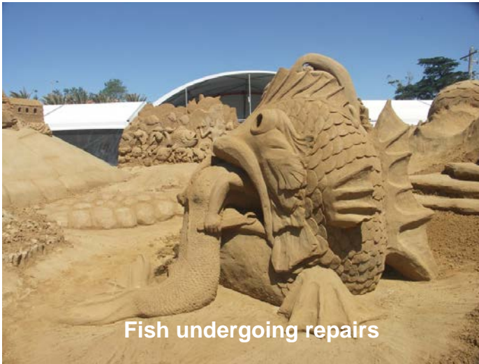
Fish undergoing repairs