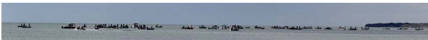
Dinghies prawning Woodgate