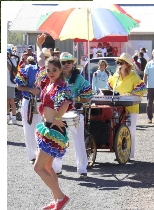
Entertainment at Tara Camel Races