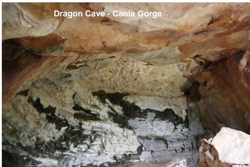
Dragon Cave - Cania Gorge