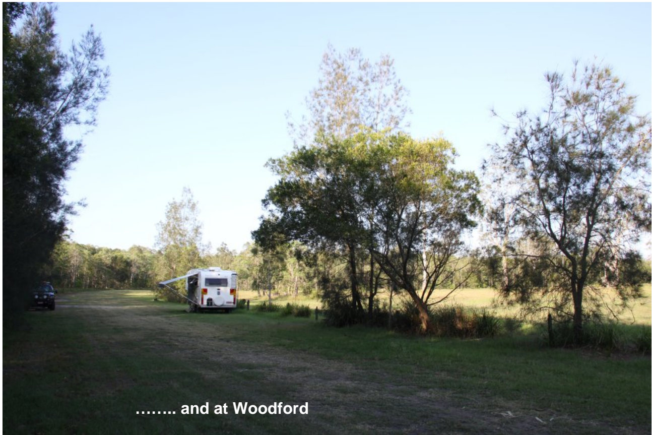
..... and at Woodford