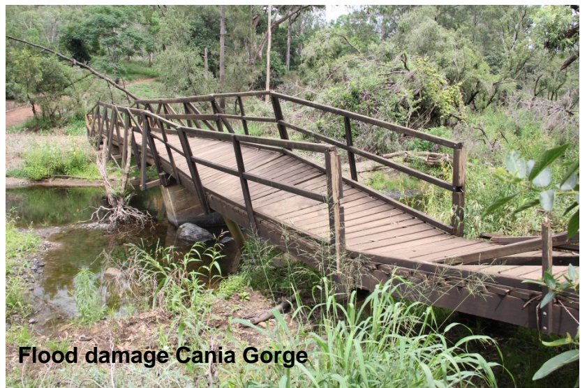
Flood damage Cania Gorge