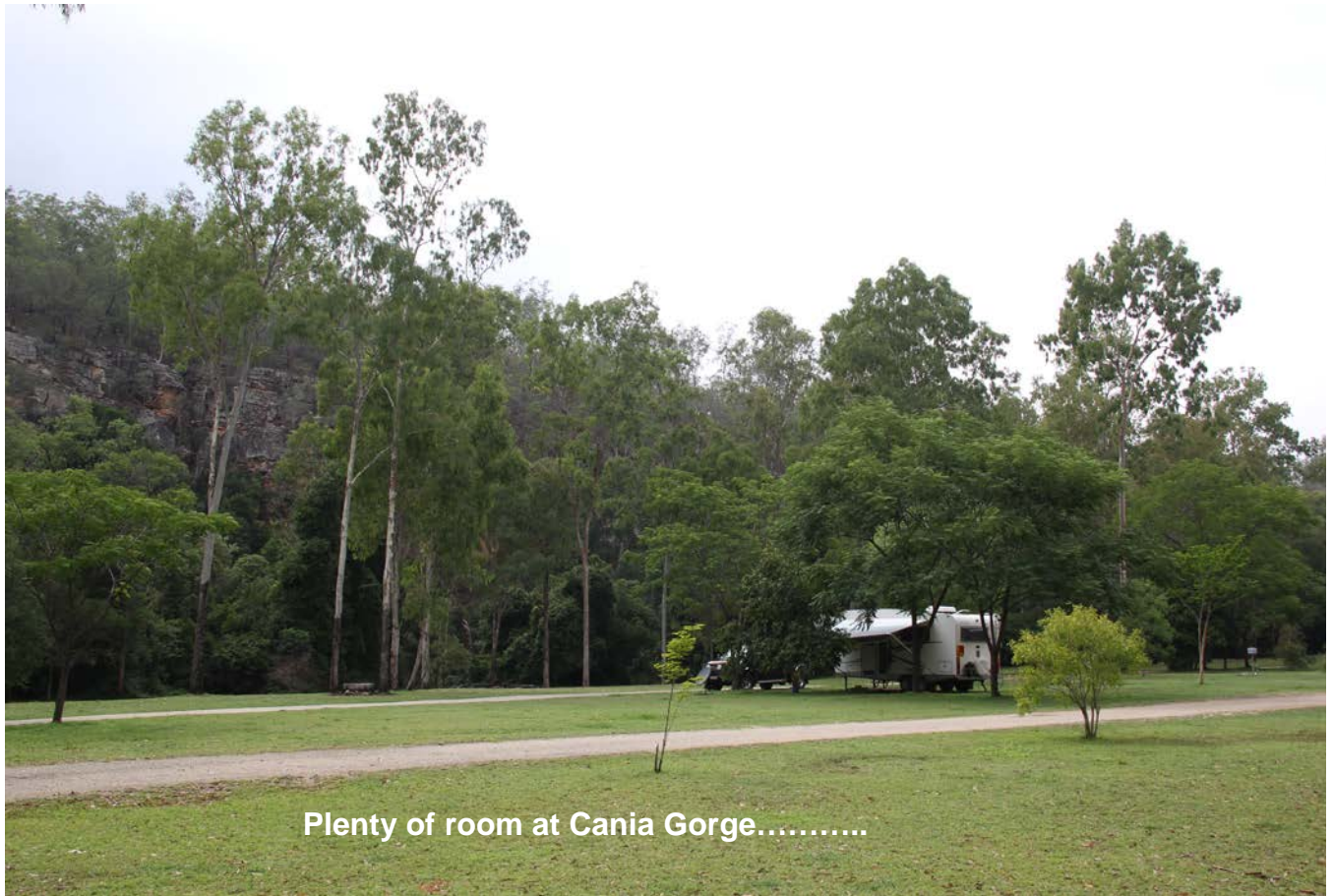
Plenty of room at Cania Gorge.....