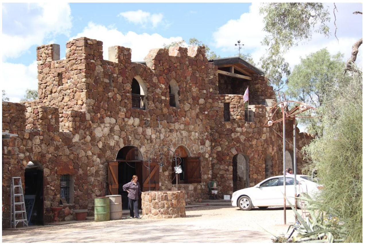
Never to be finished castle at Lightning Ridge was probably a good idea at the time