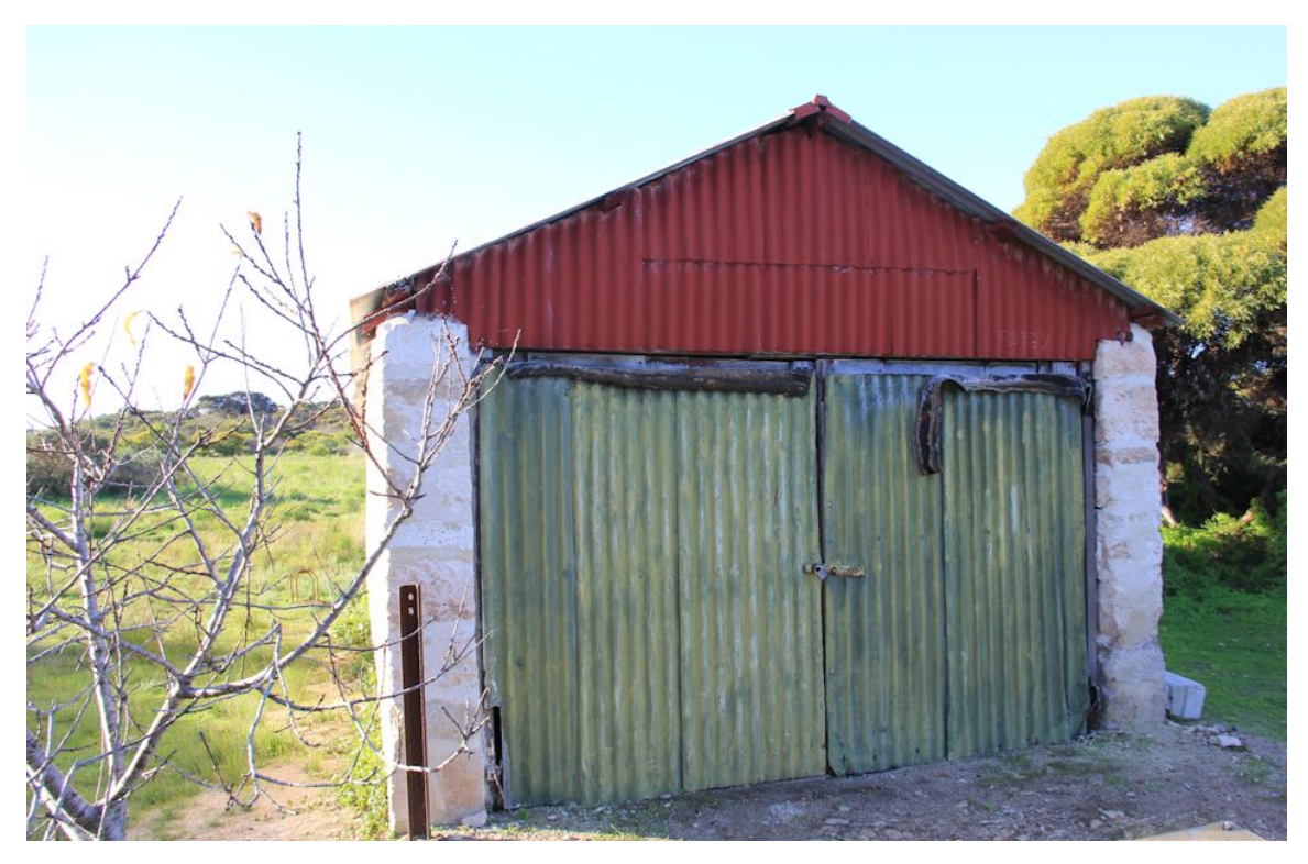
Bellco Chalk factory Innes National Park – old enough to remember Bellco chalk at school?