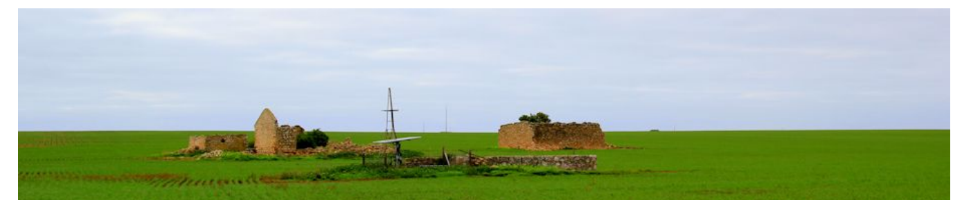
Some of the many ruins on Yorke Peninsula