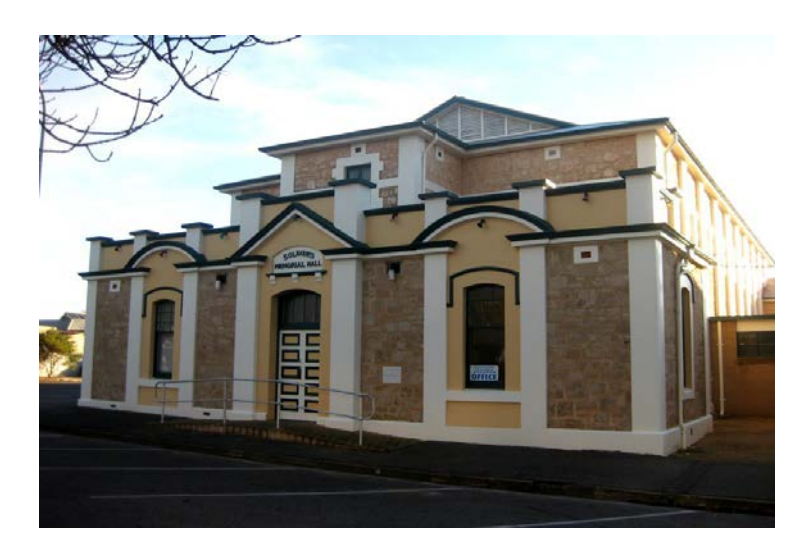
One of many Soldiers Memorial buildings on Yorke Peninsula