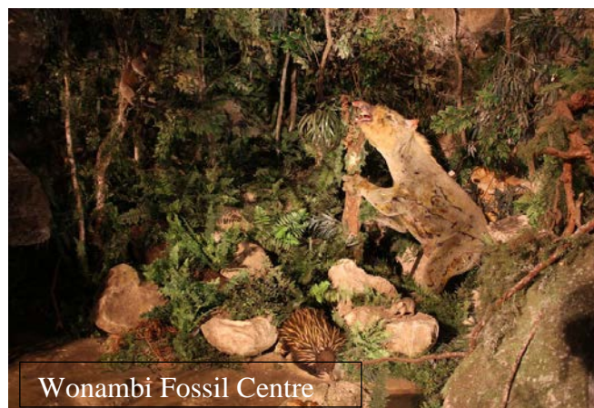
Wonambi Fossil Centre