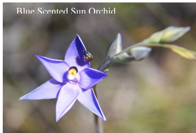
Blue Scented Sun Orchid

To Tozer's Bush Camp near Bremer Bay where we arrived at the right time to see Sun Orchids coming into bloom. There were lots of different varieties and the tour around the property well worth doing. While there we did a day trip into the west side of Fitzgerald River National Park